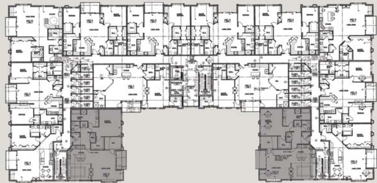
Floor plan B marked by grey boxes on floor level layouts